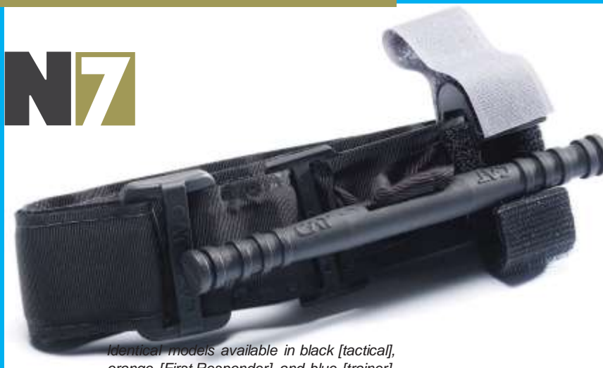
Identical models available in black [tactical], orange [First Responder], and blue [trainer].