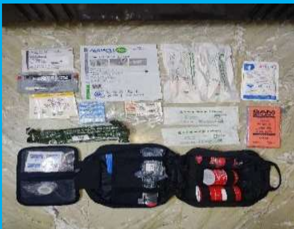
ENHANCE MEDICAL KIT